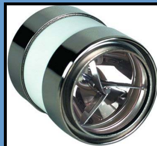
CeraLux Xenon Collimated Arc Lamp