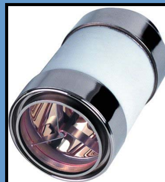
CeraLux Xenon Focused Arc Lamp

CeraLux xenon lamps produce broadband light with color temperatures of approximately 5900°K. This results in excellent white light for photopic, video and photographic applications.